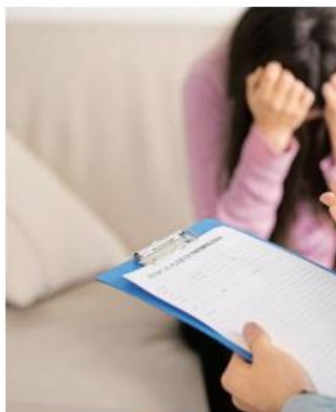
The Mental Healthcare Act provides persons with mental illness the right to information about their illness and treatment, right to information about their illness and treatment, right to information about their illness and treatment, right to information about their illness and treatment.

The Mental Healthcare Act, 2017, which was passed by the Lok Sabha in August 2016 and the Lok Sabha in March 2017, is a landmark legislation. For the first time in our country, it